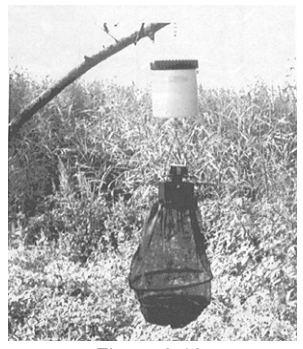
Figure 3.10. Battery-operated CDC Miniature Light Trap

(CDC) Miniature Light Trap (Figure 3.10) was developed for portability to conduct live mosquito catches in remote areas where standard electric power is not available. As the mosquitoes respond to the attractants they are blown downward through a screen funnel into a killing jar or a mesh bag suspended below the